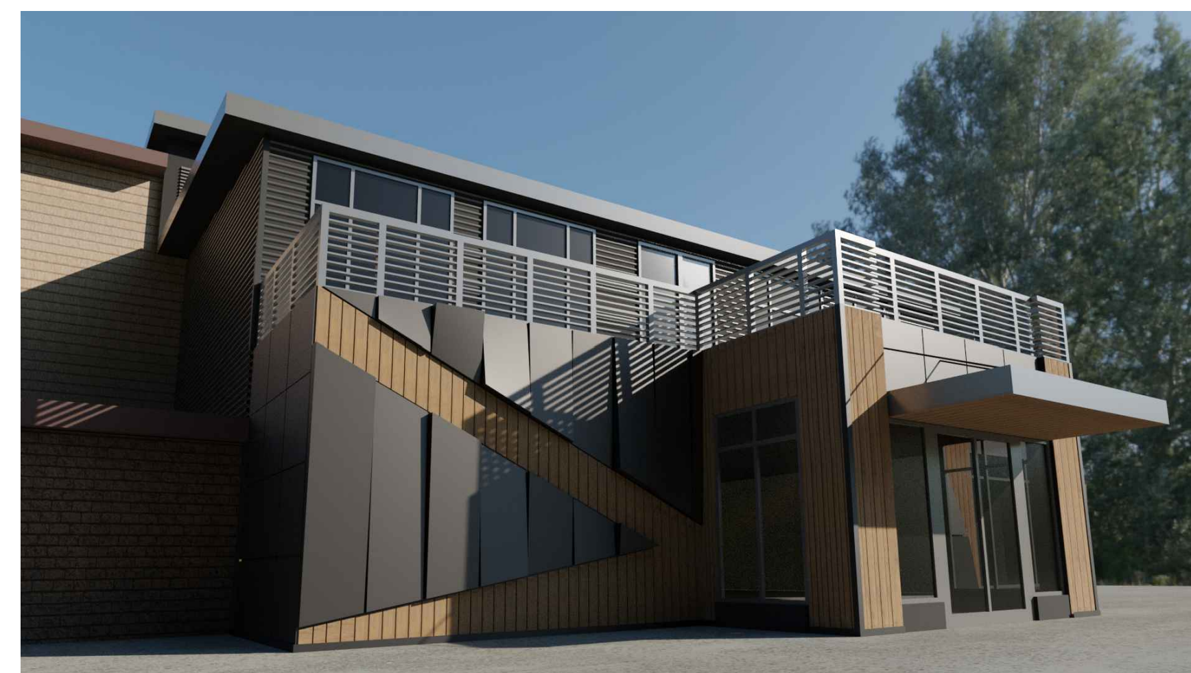
SOUTHWEST BUILDING RENDERING SCALE: N.T.S.