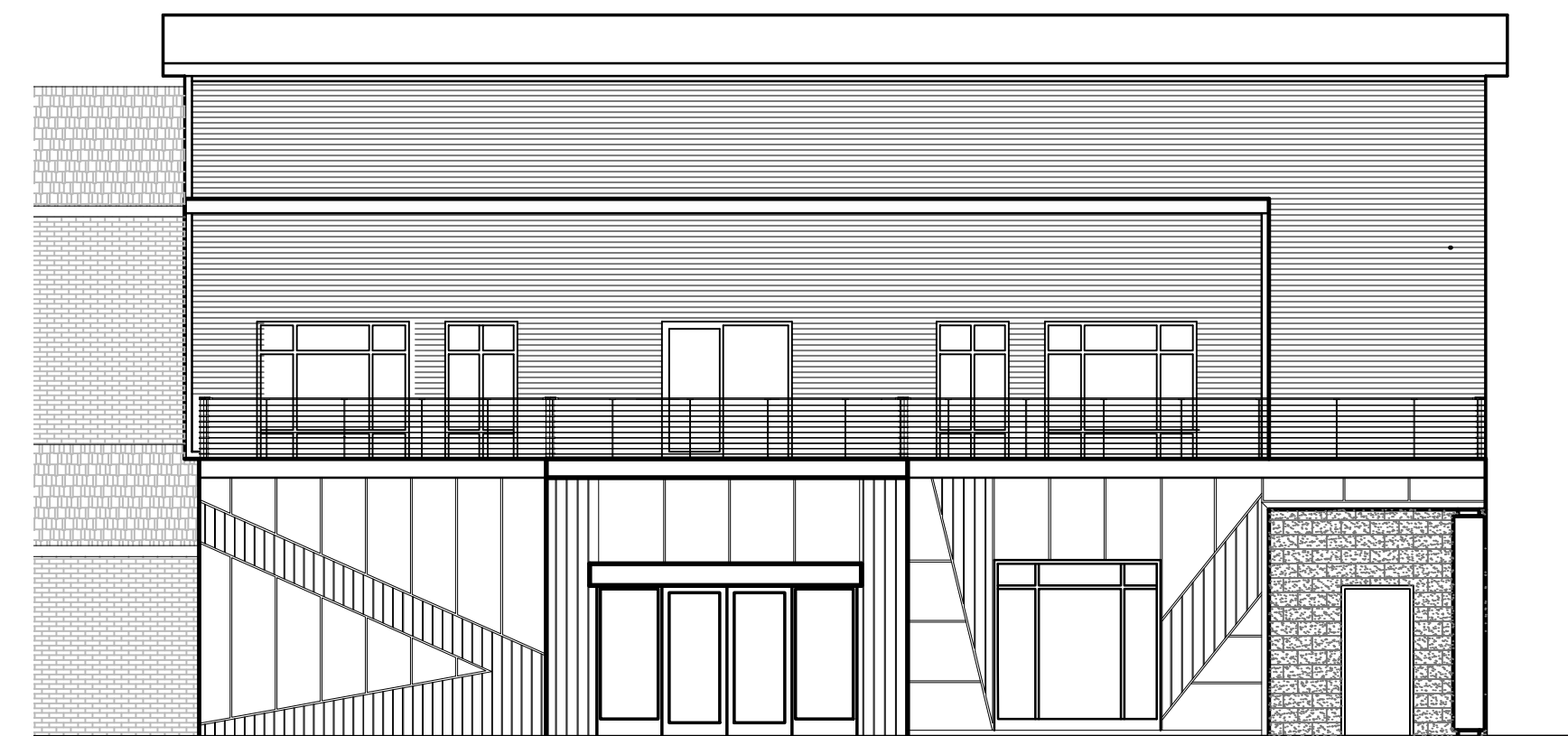
SOUTH BUILDING ELEVATION SCALE: 1/8" = 1'-0"