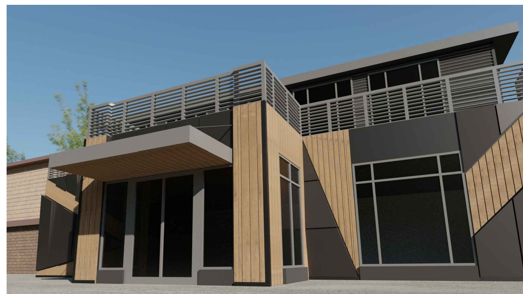
SOUTHEAST BUILDING RENDERING SCALE: N.T.S.